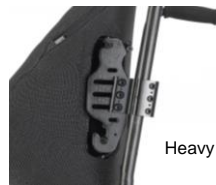
Heavy Duty hardware